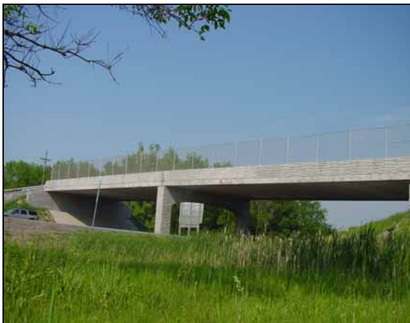
Hook Road over the New York State Thruway.

just under 100' and each bridge was 2-span continuous. The replaced bridges were four spans each.